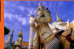
Wat Pho - Reclining budda (Recorded since 1801)