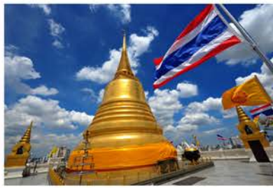
Golden Moutain Since Ayutthaya era