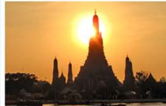
Wat (Temple) Arun