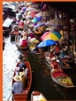
Taling Chan Floating Market