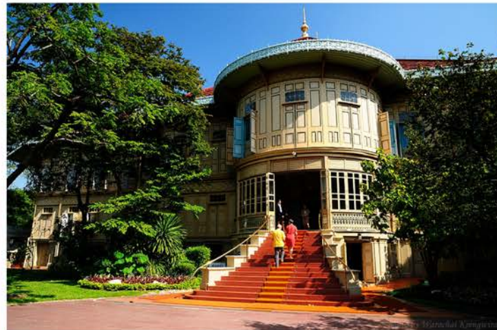
Vimanmek Mansion (Teak wood Mansion) Since 1901